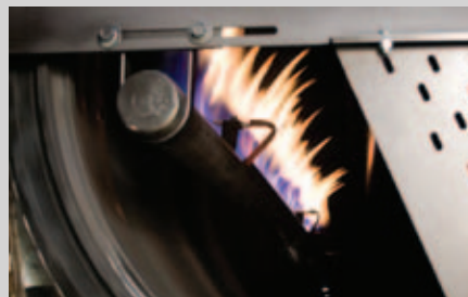
(3) modulating heat zones