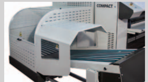
right or left orientation and front or rear output stacker