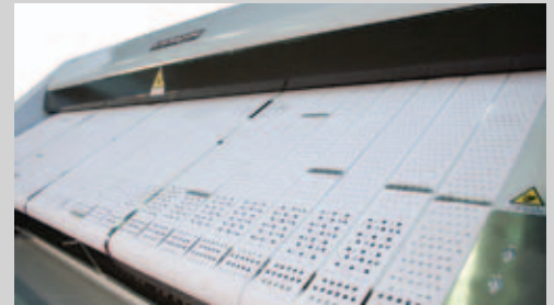
inclined feeding table

Engineered for constant use and long life, the Compact 5-in-One offers easy maintenance, including a self-cleaning exhaust fan and an industry leading 7/5/3-year manufacturer's warranty.